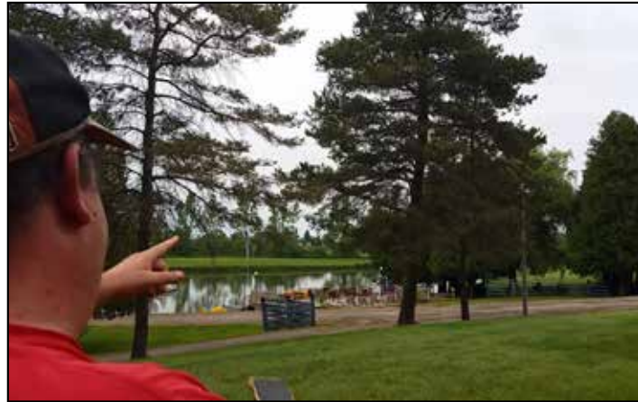
Our combined efforts led to discovery that both witness' sightings occurred in the exact same location.